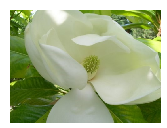
Magnolia by Norma Senn